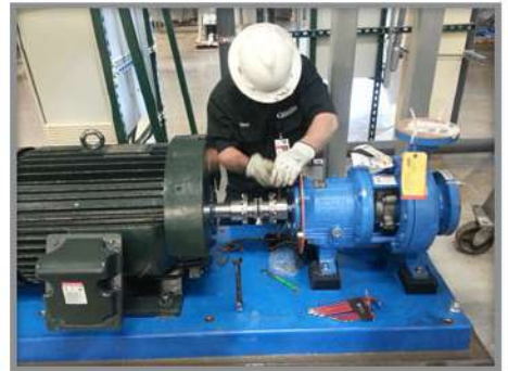
Rotary equipment Erection