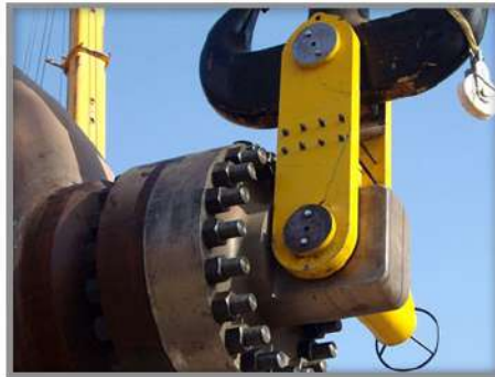
Static equipment Erection