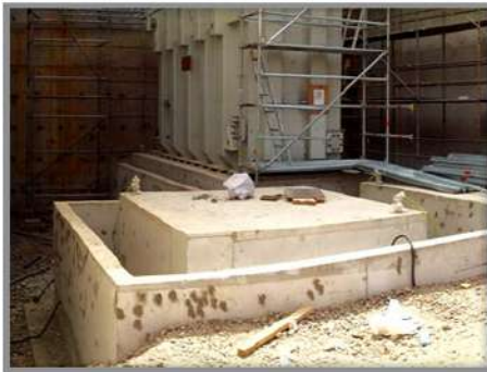
Foundation for Equipments

Mechanical Installation works split into two segments Static Equipment and Rotary Equipment. Which includes Foundation preparation and Pipe racks, Warehouse structures, Process building, Structures Installation and alignment works.